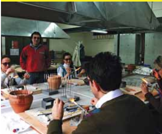
Students from 48 countries have come to the Glass Furnace