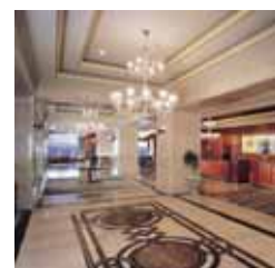
The Ritz Carlton, Istanbul