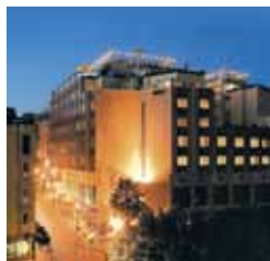
Best Western The President Hotel