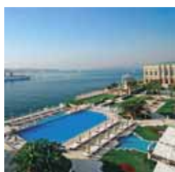
Çırağan Palace Kempinski

Wining and Dining: Tuğra Restaurant (classical Turkish and Ottoman cuisine) Laledan Restaurant (seafood specialities), Gazebo Lounge and restaurant (international cuisine, open 24 hours), Çırağan Bar, Çırağan Bosphorus Barbecue (summer only).