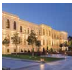
Four Seasons Hotel Istanbul

Rooms: Four Seasons Hotel Istanbul at the Bosphorus offers 141 guest rooms and 25 suites. Bright and