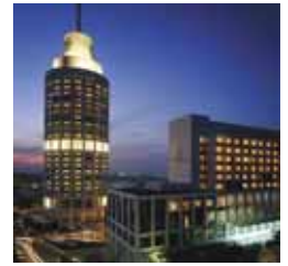
Sheraton Hotel & Convention Centre

Wining & Dining: Margaux Restaurant (international cuisine), Breeze Bar (lobby bar), Swiss Cake (shop with chocolates, cakes, pastries and Mövenpick ice cream.)