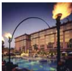
Hyatt Regency Istanbul

Wining & Dining: Vista Restaurant, Piano Bar, Saray Cafe, 24-hr room service.