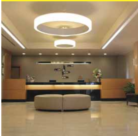
Midtown Hotel Istanbul