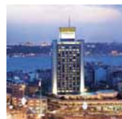
The Marmara Istanbul