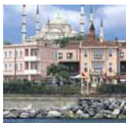
Best Western Citadel Hotel

Wining & Dining: Ocakbaşı Grill House and Terrace Restaurant, Breakfast Lounge, patisserie, cafeteria, 24-hour room service.