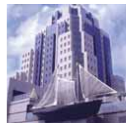
Grand Cevahir Hotel & Convention Centre

Guest Services: Indoor swimming pool, 24-hour open fitness centre, authentic Turkish hammam, Wi-Fi inter-