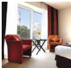
Barcelo Saray Hotel

Wining & Dining: Çintemani Restaurant (all-day dining), The Lobby Lounge, RC Bar and Guney Park Terrace (summer only).