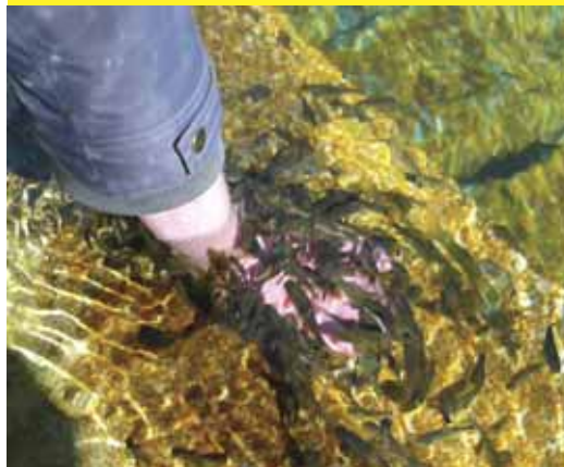
About 3000 visitors per year seek treatment from the doctor fish