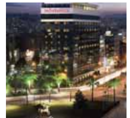
Mövenpick Hotel Izmir